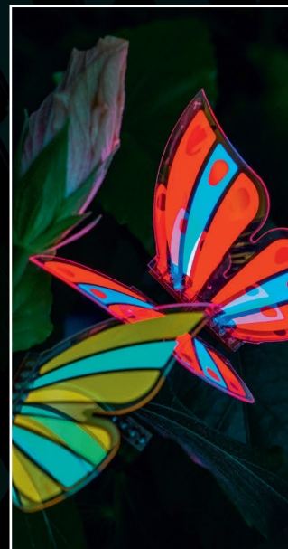
OPE journal Issue 36