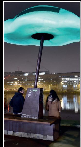
OPE journal Issue 37