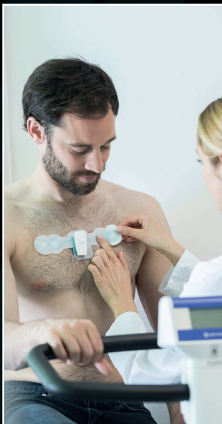
OPE journal Issue 34

Get your personal offer! Please contact Nina Pirchmoser Phone +49 8033 302-1275 • nina.pirchmoser@dfv.de