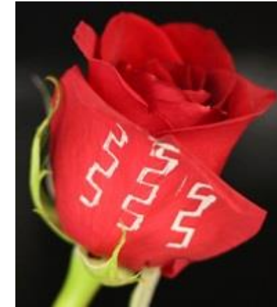
SAFI-Tech microcapsules screen printed onto a rose petal and activated to form a conductive metal trace.

Encapsulated soldering metal alloys stabilized in the liquid phase at room temperature