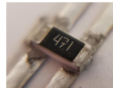
SAC305 microcapsules soldering to silver traces on PET at 120 °C